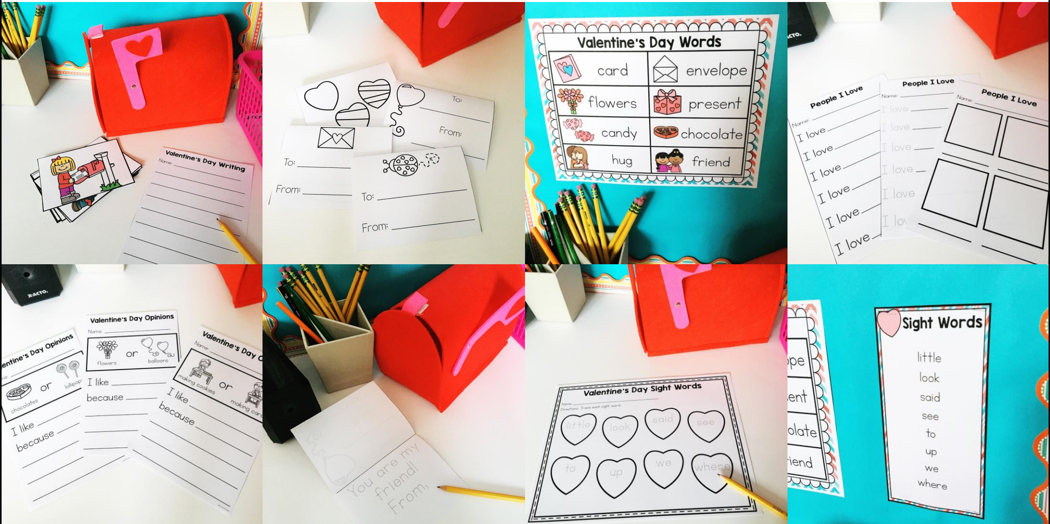
Six Writing Center Activities by Katie Roltgen